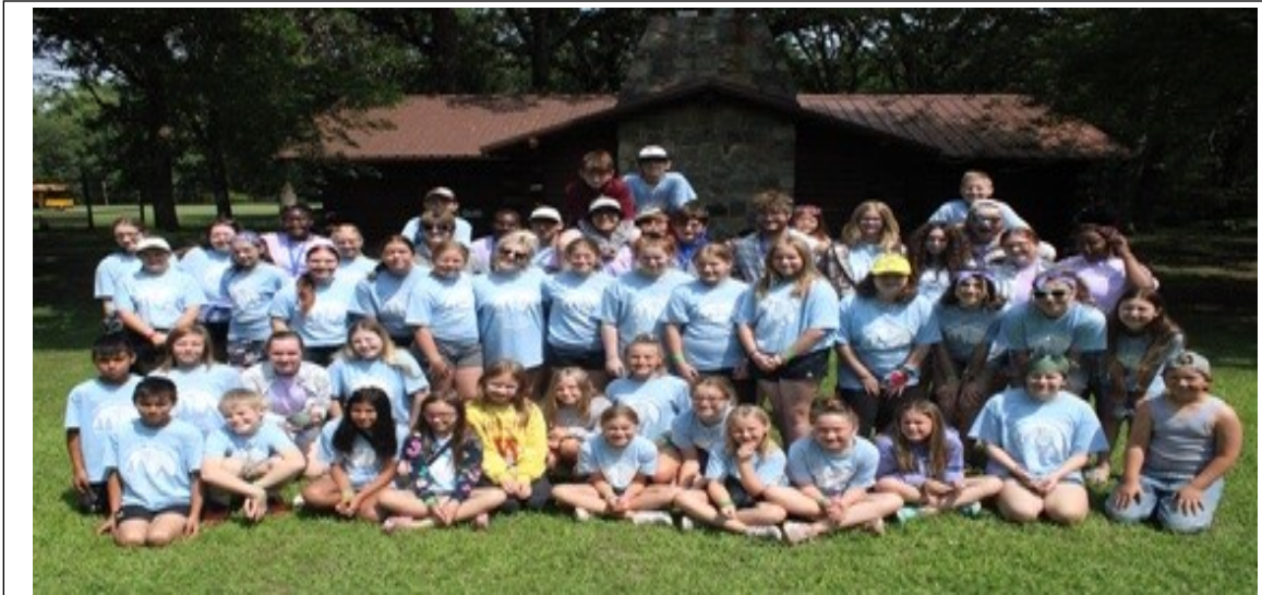
Thank you for your part in sending kids to camp. We had a great summer!